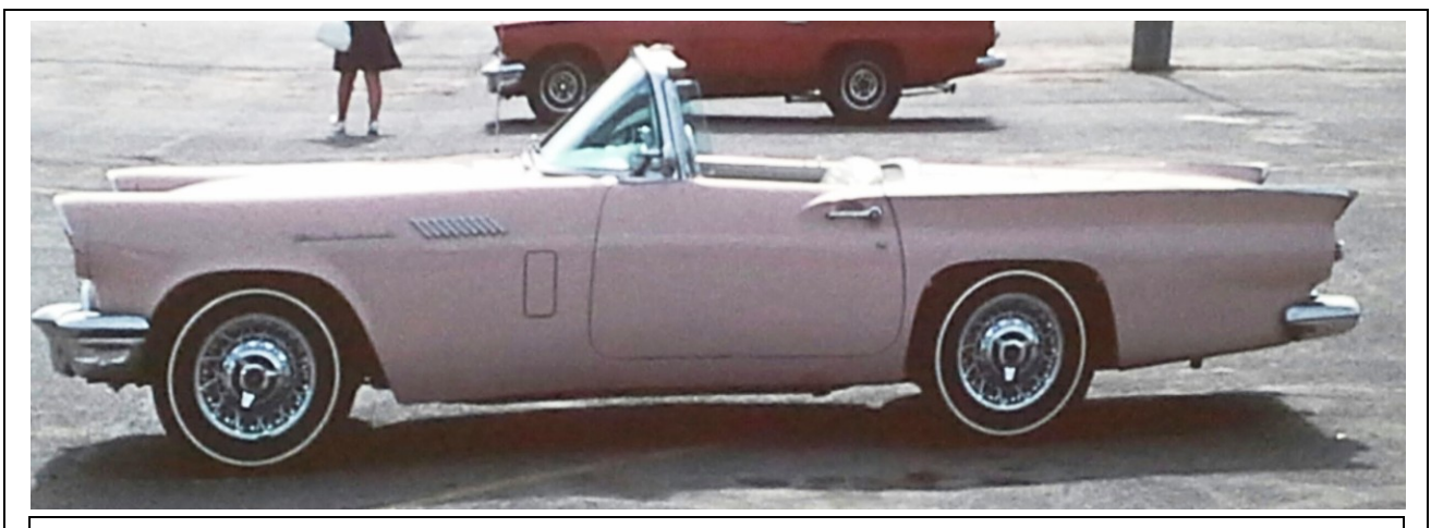
T-Bird Trivia Quiz – What's wrong with this 1957 Ford Thunderbird??

Answer: It is the only known '57 T-Bird without a hood scope. It was special ordered by Lois Eminger who worked for FoMoCo back in the day. BTW; Lois is the person who rescued the factory invoices.