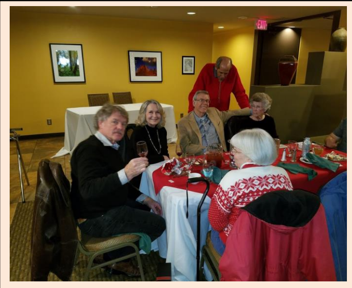
Pajarito Thunderbird Club of New Mexico – CTCI Chapter 17