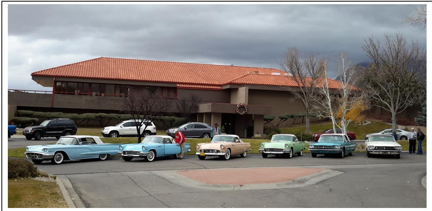
Pre-Christmas Party Display at Tanoan Country Club