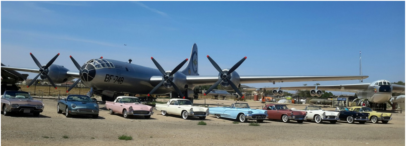
The Pajarito Club tours the National Museum of Nuclear Science and History