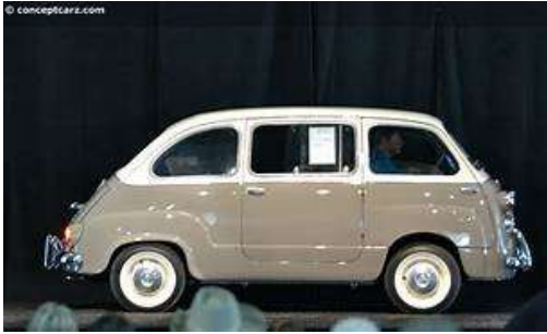
1958 Fiat 600 Multipla