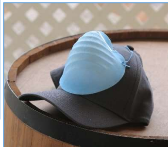
Even the caps wore masks