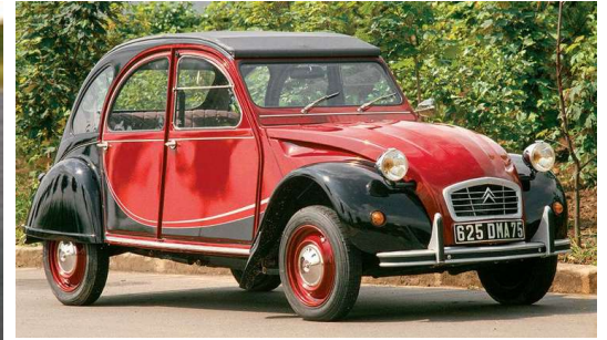
1962 Citroën Deux Cheveux (2CV)