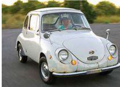
1969 Subaru 360