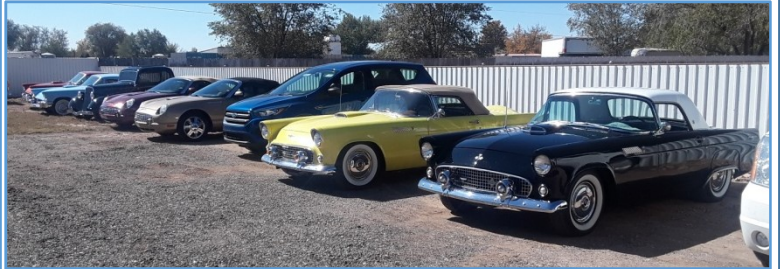
The line-up on T-Bird Lane