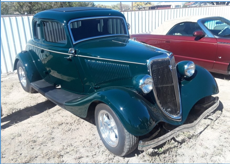
Fred Lachenmeyer's beauty