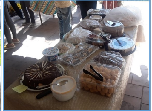
Awesome food enjoyed by all