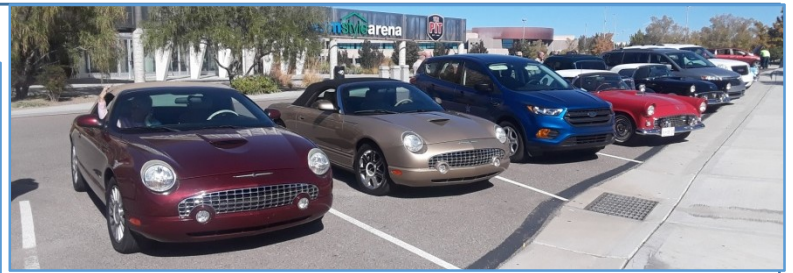
Ready to leave the Pit for Los Lunas