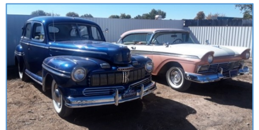
Jim Kontny's raft of classics