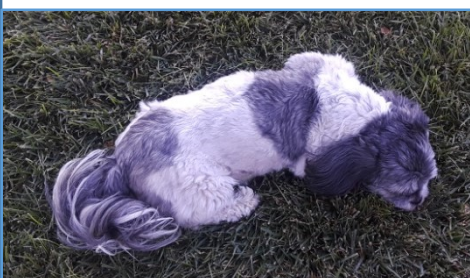
The Kontny pouch was unphased!